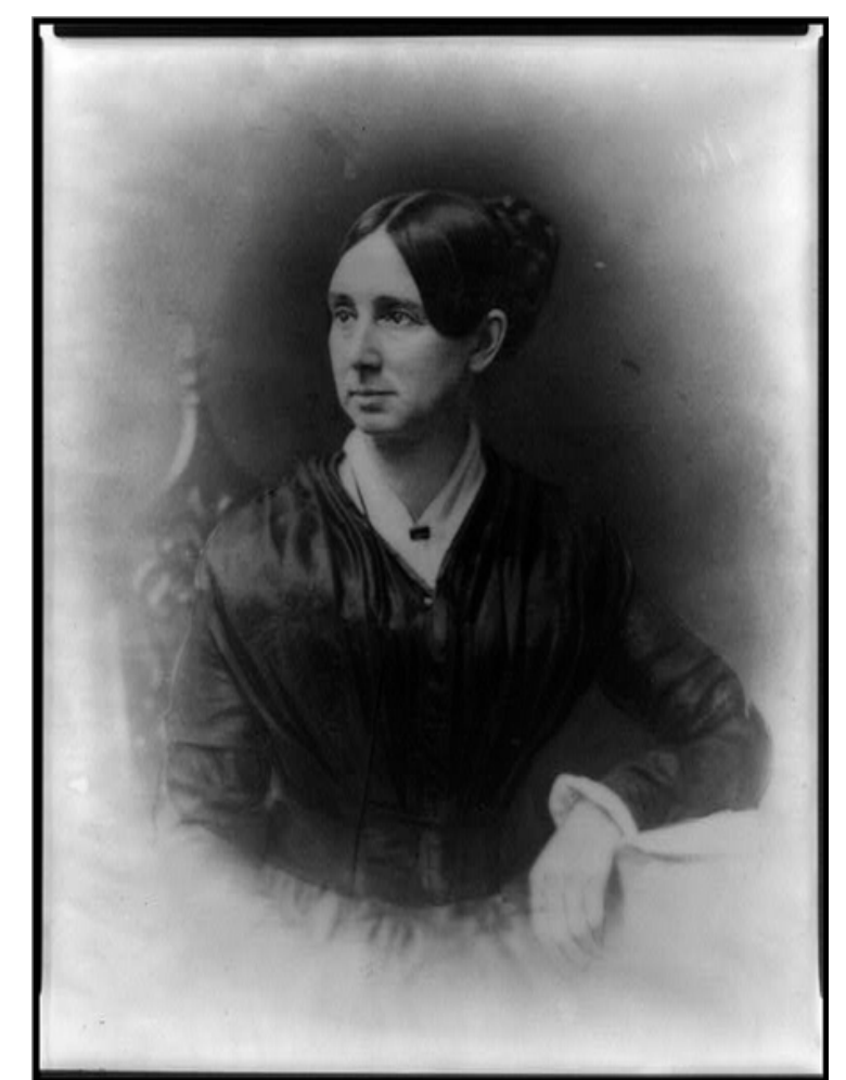
Portrait of Dorothea Dix