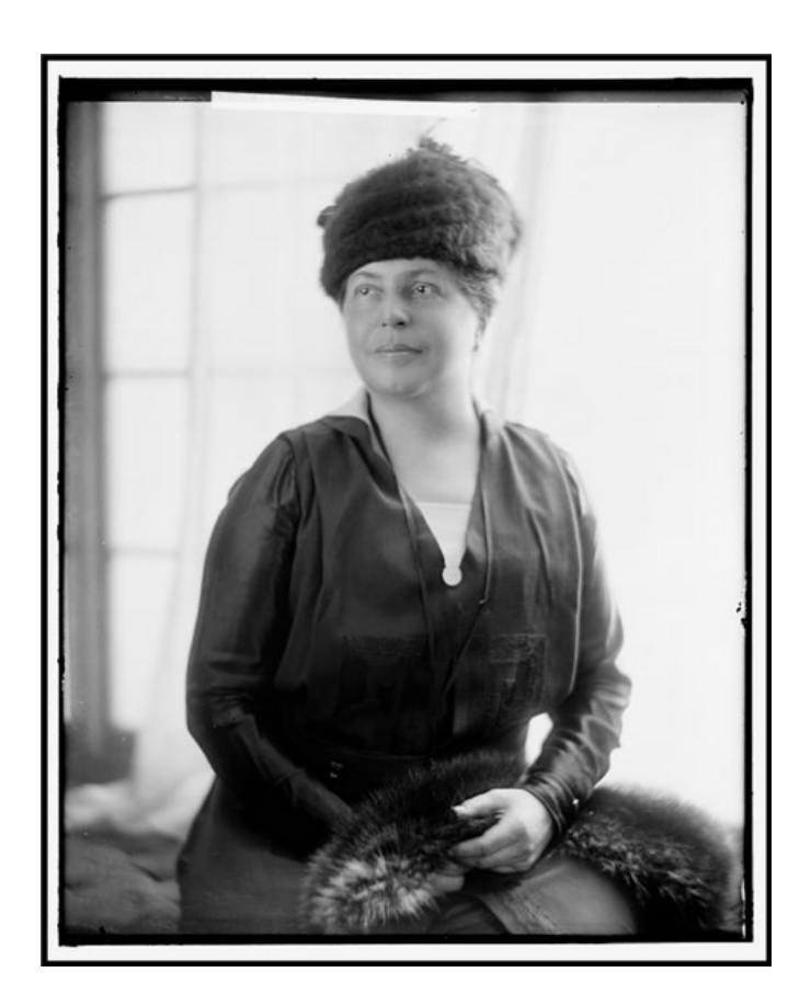
Portrait of Lillian Wald