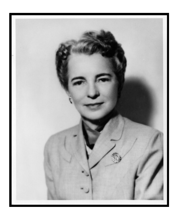
Portrait of Lucile Petry Leone